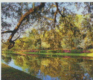
The Reflection Pool

the world. Guests stroll through vast garden “rooms,” laid out with precise symmetry and balance, to the climactic view over the Butterfly Lakes and the winding Ashley River beyond. Today, as they did then, the gardens represent the Low Country's most spectacular and articulate expression of an 18th-century ideal – the triumphant