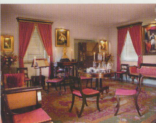
Music Room in the House Museum

Tour the Middleton Place House Museum (1755), built as a gentleman's guest wing beside the family residence. Today it serves as a museum of rare Middleton family furniture, silver, china, books, and historic documents.