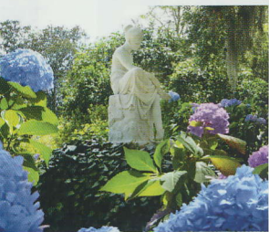
The Wood Nymph, c. 1810

Walk the same footpaths through these gardens as did pre-Revolutionary statesmen. Enjoy the same vistas that inspired four generations of the distinguished Middleton family from 1741 to 1865. Here lived Henry Middleton, a President of