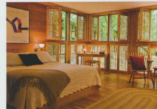
Relaxing accommodations at the Inn

No visit to Charleston is complete without the Middleton Place experience – a feast for the senses and a true journey back in time.