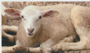
Gulf Coast Sheep

Take in the sights and sounds of the working Plantation Stableyards . Professional interpreters demonstrate the skills performed by enslaved people in the 18th and 19th centuries, surrounded by the domestic animals who work and live among them.