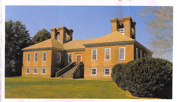
483 Great House Rd. Stratford, VA 22558