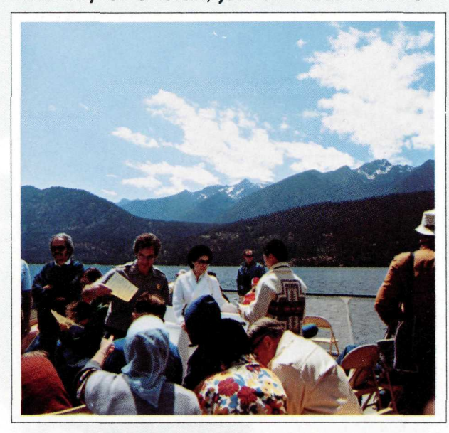
Wenatchee, is in the heart of Washington, approximately 170 miles from both Seattle and Spokane.

ake Chelan, nestled in the deepest gorge in North America, is one of Washington's largest inland bodies of fresh water. Though the average width is less than two miles, the lake extends 55 miles into the Cascade Mountains, and dips to over 1500 feet. This means that at its deepest point Lake Chelan drops to 400 feet below sea level. This clear blue lake, fed by 27 glaciers and 59 streams, is recognized as one of the most scenic in the Pacific Northwest. It's also one of the most easily accessible. The city of Chelan, just 35 miles north of