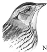
Nelson's Sharp-tailed Sparrow & Saltmarsh Sharp- tailed Sparrow

the nearby Outer Banks (Cape Hatteras National Seashore, Pea Island National Wildlife Refuge). During late fall and winter, the 5,100-acre farming area attracts an impressive variety of waterfowl and raptors, and several rarities—such as Swainson's Hawk and Ash-throated Flycatcher—have been found here. At any season, you might see Northern Bobwhites, and maybe a King Rail. Please pay attention to refuge regulations and signs marking closed areas.