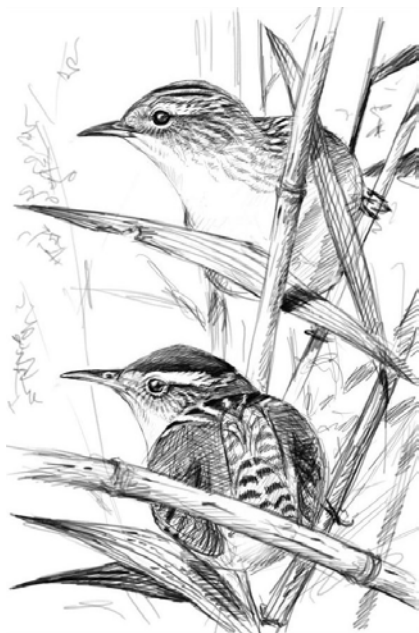
Sedge Wren & Marsh Wren