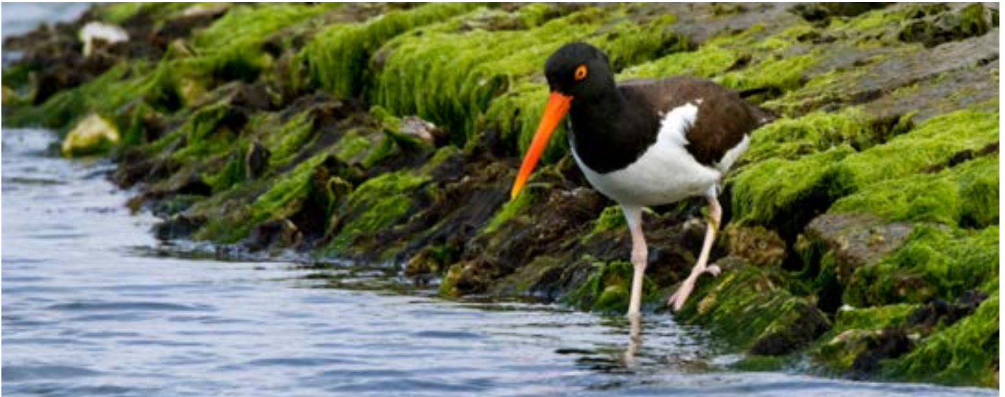
American Oystercatcher at Aransas National Wildlife Refuge