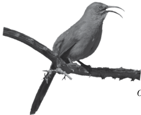
Crissal Thrasher