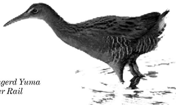
Endangered Yuma Clapper Rail USFWS