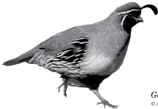
Gambel's Quail