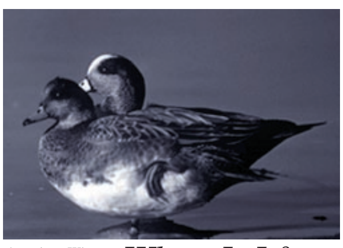
American Wigeon

Visitors are welcome to enjoy fishing, hiking, and wildlife observation. However, hunting is not permitted.