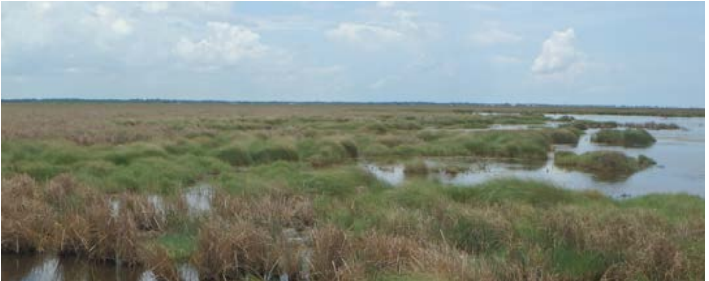
Big Boggy National Wildlife Refuge

No. Being included within an expansion boundary does not give the Service any more authority over private or public lands. Landowners retain all the rights, privileges, and responsibilities of private land ownership.