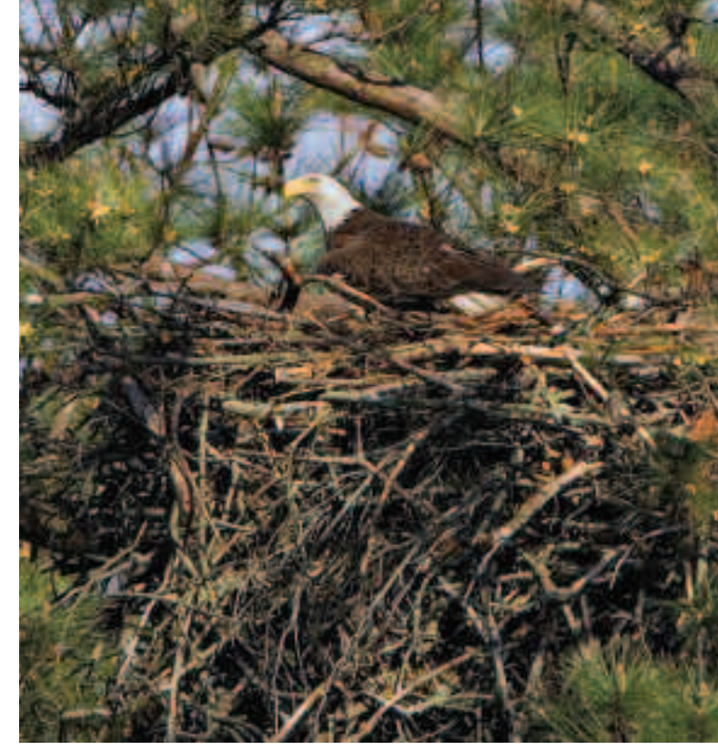
Adult bald eagle in nest

Numerous marsh and shore birds arrive in the spring and fall, searching for food in the vast mud flats and shallow waters of the Blackwater river. Ospreys, or "fish hawks," are common from spring through fall; and