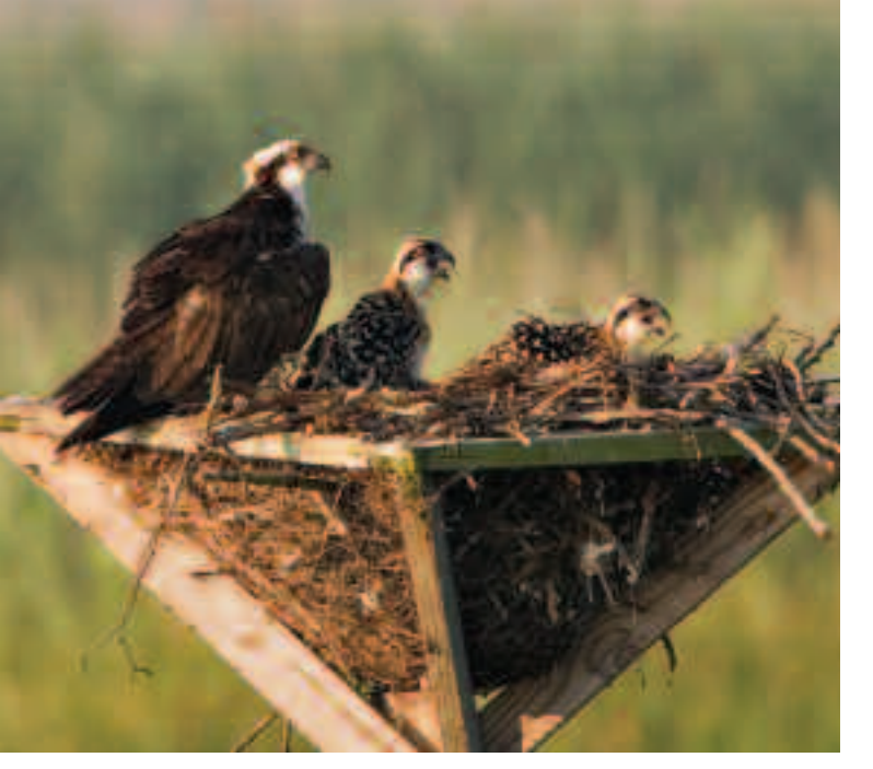
Osprey in nesting platform