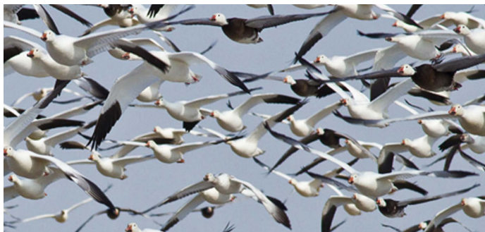
Lesser snow geese