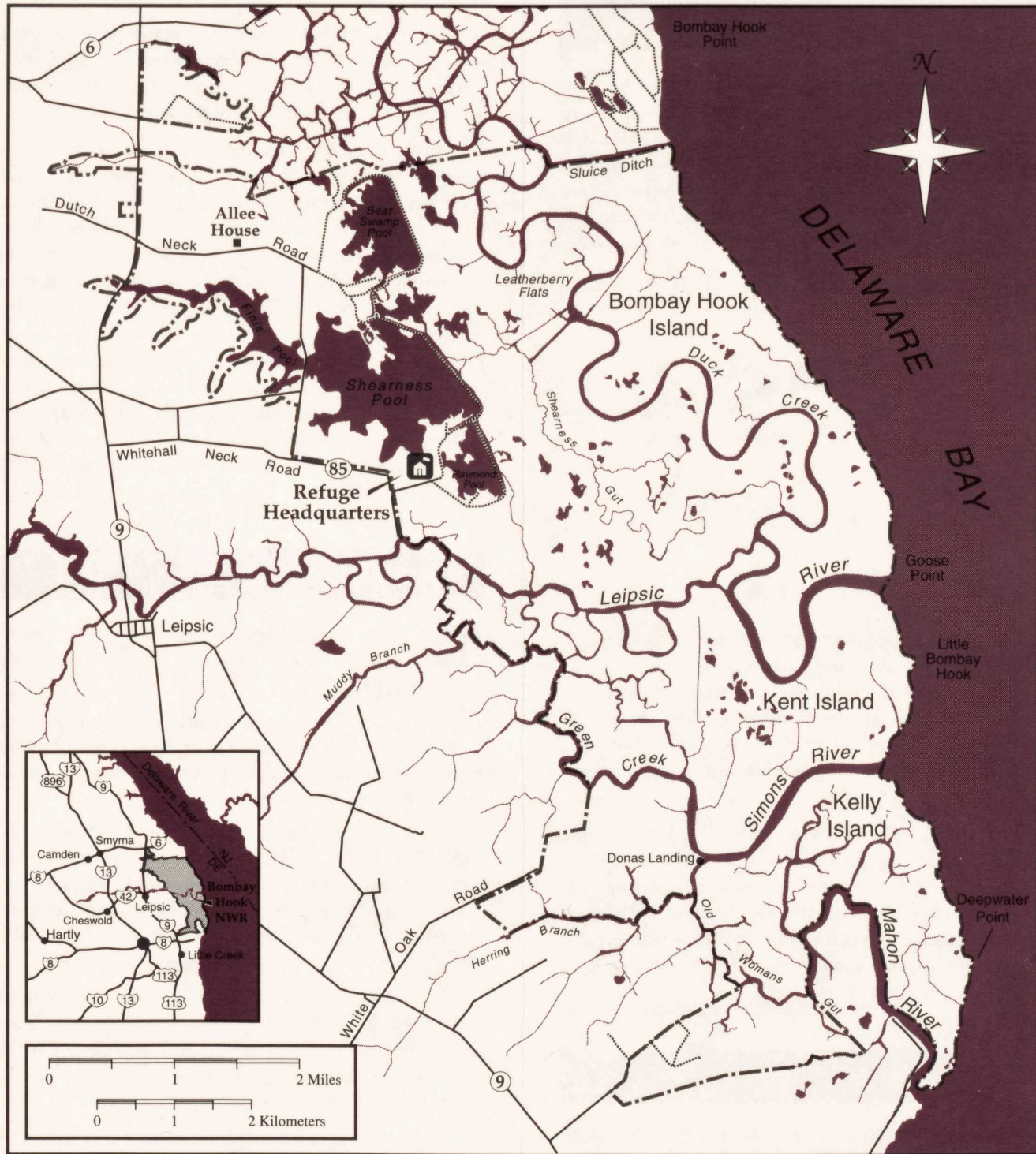
Heading North on Route 13 from Dover, take Route 42 East to Route 9, Leipsic. Proceed North on Route 9 for 2 miles to Road 85 which ends at the refuge entrance. Heading South on Route 13 from Smyrna, take Route 12 East until it merges with Route 9 (5 miles), and take a left on Road 85 after 1/4-mile.