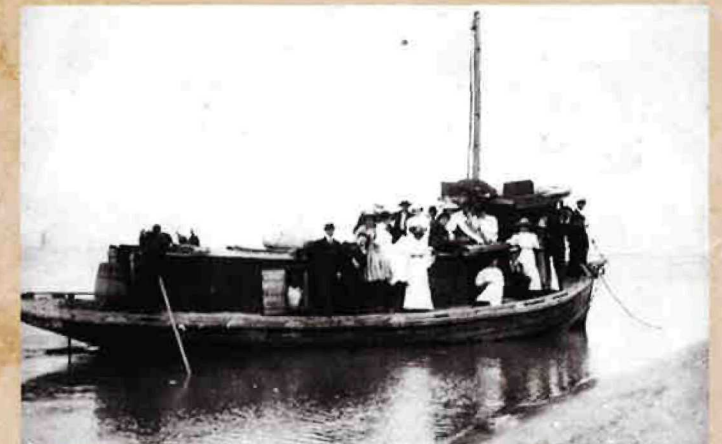
The Spray takes villagers to the Cape, credit: The Village Museum

During the early 1900s, Lighthouse Island also came to be a destination for area residents, especially those from McClellanville, for picnics and other social events. As an excellent location for fishing, crabbing, oystering, and recreational sailing, local mariners have through history and continue to make frequent use of the lighthouses as fixtures on the flat horizon to navigate around the islands and hammocks in the area.