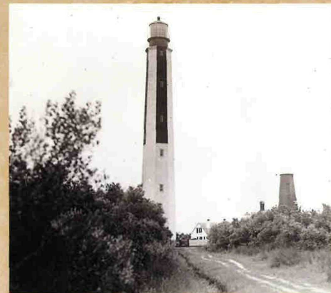
Cape Romain Lighthouse

Completed in 1857, and first lit early in 1858, another lighthouse replaced the first when it proved to be ineffective. The octagonal brick structure rose to 154