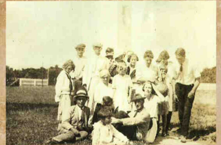
McClellanville residents

From 1827 until the 1930s, keepers and assistants lived on the island with their families in order to have daily access to the lighthouses. Keepers maintained a rigorous daily routine of cleaning and painting structures, polishing lenses and lamps, and carrying oil, tools, and other supplies up the 212 stairs to the top of the lighthouse. The families planted gardens and ornamental plants and trees, some of which grow to this day. The location of the lighthouses on the distant island meant that purchasing supplies, going to school, or hosting visitors required boat rides to and from the mainland.