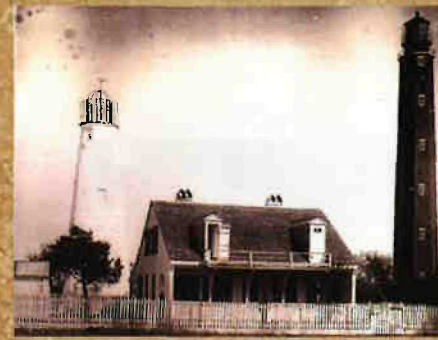
Keeper's residence

The Lights as Historic Site The lighthouses at Cape Romain were listed on the National Register of Historic Places in 1980 through the initiative of regional government. The 1827 lighthouse is the second oldest in South Carolina, and the oldest in