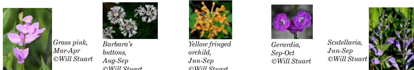
Grass pink, Mar-Apr Barbara's buttons, Aug-Sep Yellow fringed orchid, Jun-Sep Gerardia, Sep-Oct Scutellaria, Jun-Sep