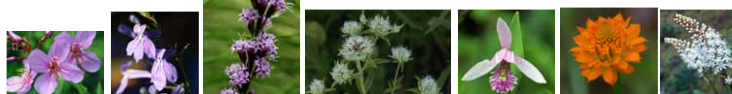
Meadow beauty, May-Sep Lobelia, Aug-Sep Blazing star, Aug-Oct Mountain mint, Jul-Sep Rose pogonia, May-Sep Orange milkwort, Apr-Aug Fly poison, May-Aug