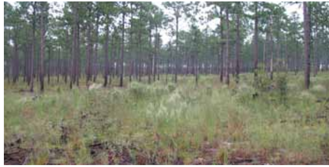
Longleaf pine

The longleaf pine and wiregrass ecosystem, the characteristic habitat of Carolina Sandhills National Wildlife Refuge, once covered approximately 90 million acres in the Southeastern United States. This unique ecosystem, shaped by thousands of years of natural fires that burned every two to four years, has been reduced to fewer than three million scattered acres. The Carolina Sandhills National Wildlife Refuge encompasses more than 45,000 acres of this unique ecosystem.