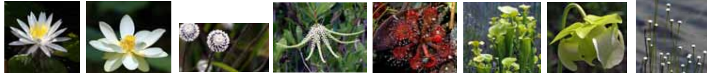
White water lily, Jun-Sep American lotus, Jun-Sep Bog buttons, Jun-Sep Titi, May-Jul Sundew, Mar-May USFWS Yellow trumpet pitcher, Mar-Apr Purple pitcher plant flower, Apr-May Hatpins, Jun-Oct