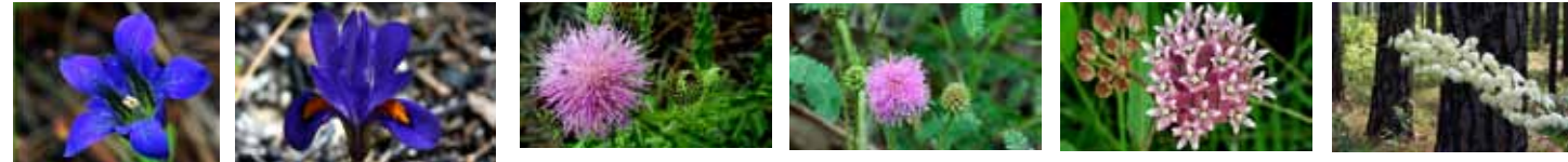
Pine barrens gentian, Sep-Oct Dwarf iris, Apr-May Purple thistle, Jun-Aug Sensitive briar, Jun-Sep Milkweed, May-Jun Yucca, Mar-Jul