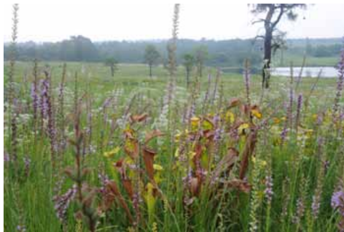
Oxpen seepage bog