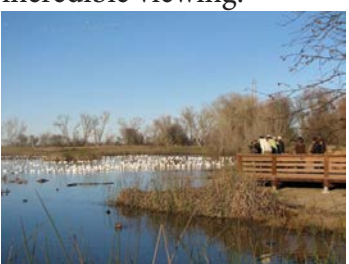
Observation Deck at the Visitor Area has up-close views of wildlife

picnic tables, native plant garden, trailhead, and an Observation Deck with incredible viewing.