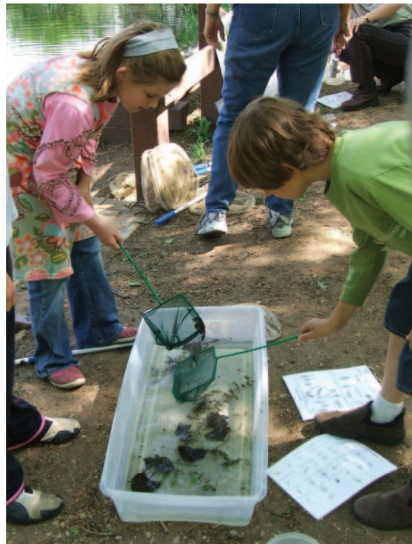
Students from East Union Elementary School use nets and buckets for Pond Insect Investigation.

Some popular courses include Prairie Insect