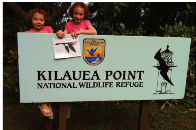
Barrett Elementary School