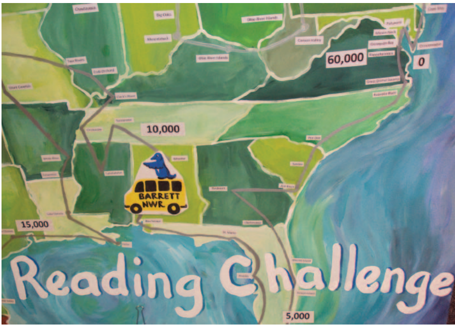
Barrett Elementary School

On a giant map of the United States, Puddles “drove” a school bus through several states every time the children read another 5,000 books. Reading is the fuel for the bus to pass by more and more national wildlife refuges.