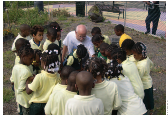
Kindergarteners were accompanied on each trip to the refuge by a class of sixth-graders. Everyone had work to do in the garden.