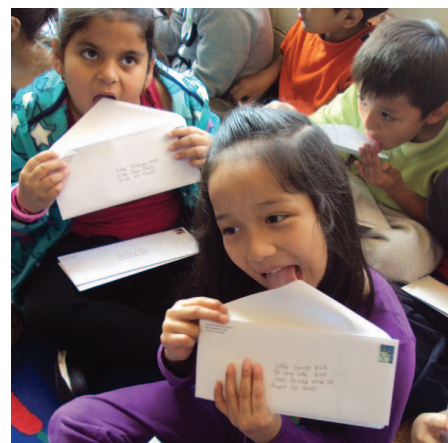
Barrett Elementary School