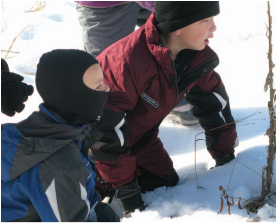
Who goes there? Three Refuge Partner Schools send students to Minnesota Valley National Wildlife Refuge for spring, fall and winter field trips.

Survey, targeted toward second- and third-graders, although this may be altered to suit first-graders since the state guidelines are changing. Students collect a half-dozen or so butterflies, grasshoppers and other insects and use a chart to record how they are similar and different. They create graphs, tally numbers, write or draw about their observations and build their math and critical observation skills – all in one exercise.