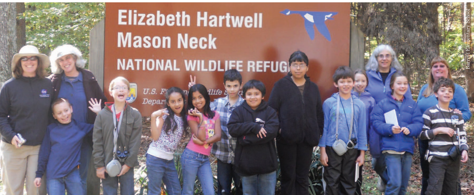
Barrett Elementary School