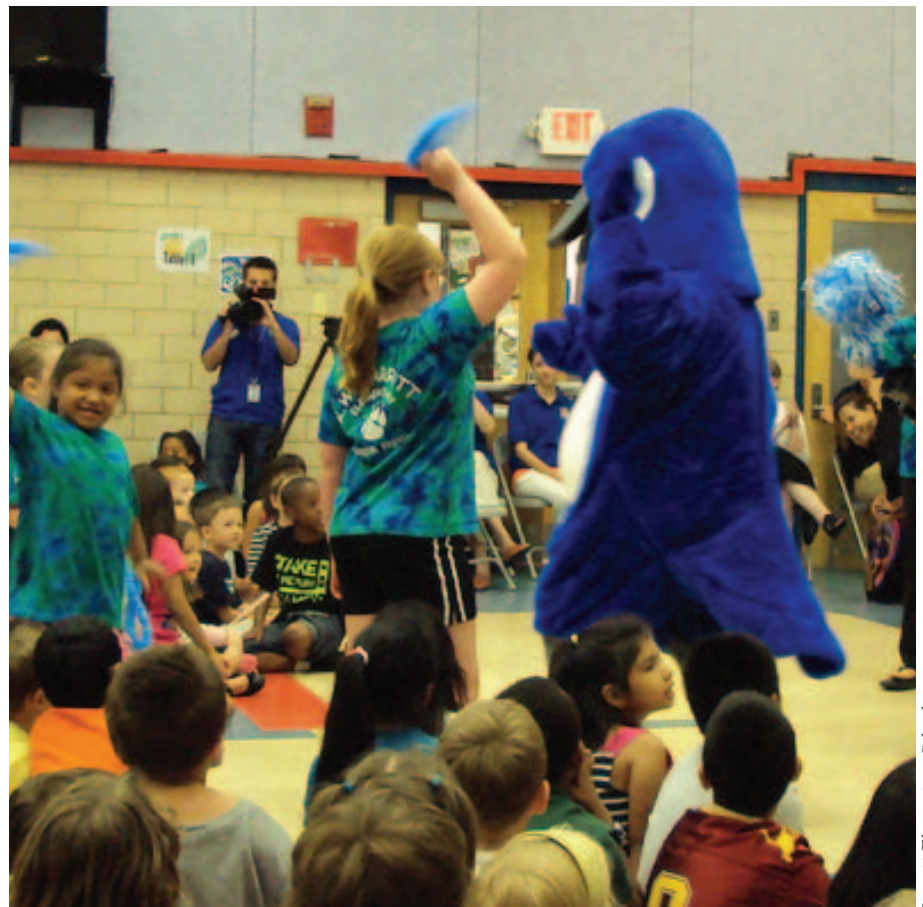
Barrett Elementary School