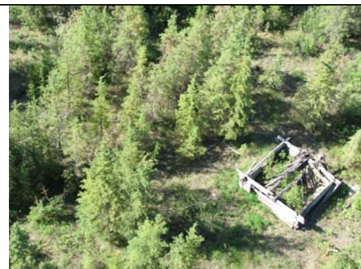
Historic cabin remains recorded at mile 14 along the Caro Trail during work BAER conducted in the summer of 2006..

BAER is only to be used to investigate and mitigate damage to known cultural resources. It is not a means to conduct wide scale inventory. However, with the vast distances, often vague locational information available for sites, and lack of personnel and time to conduct more extensive surveys, it has proven an invaluable tool for monitoring, evaluation and verification of information. Baer has enabled us to perform some real work on two refuges that had rarely been visited by archaeologists and whose cultural treasures are virtually unknown. For more information contact Debbie Corbett