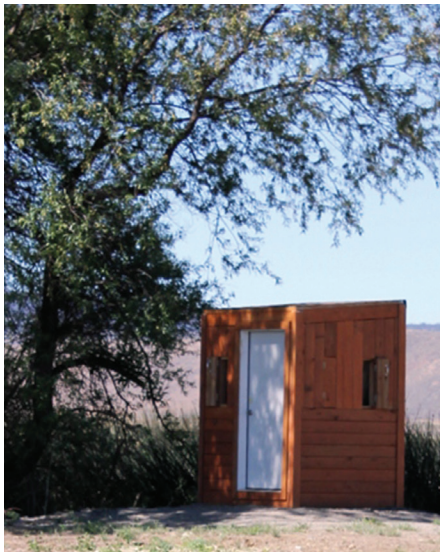
Photo Blind at Lower Klamath NWR USFWS