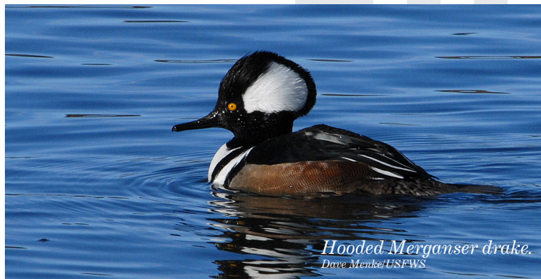
Hooded Merganser drake.