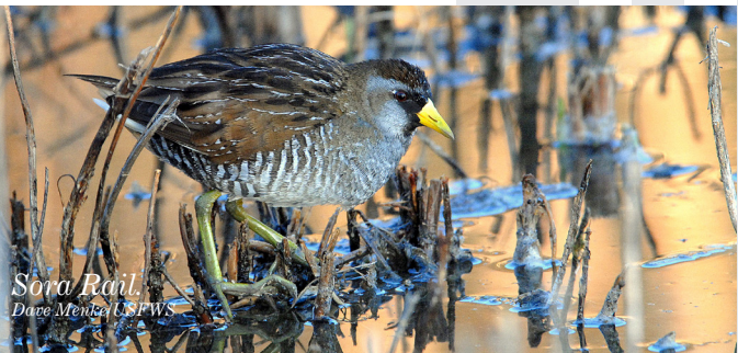
Sora Rail