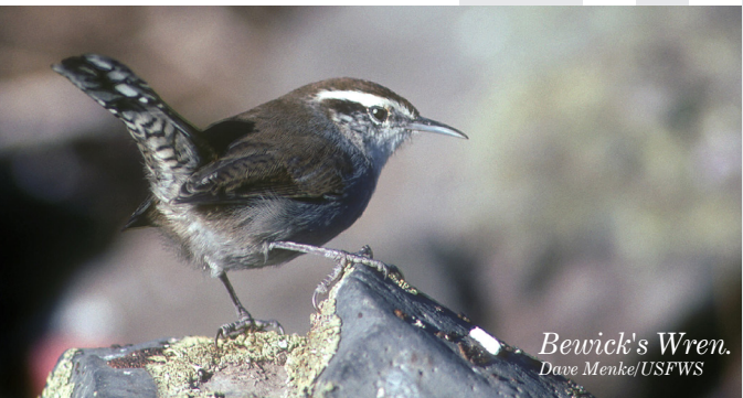
Bewick's Wren.