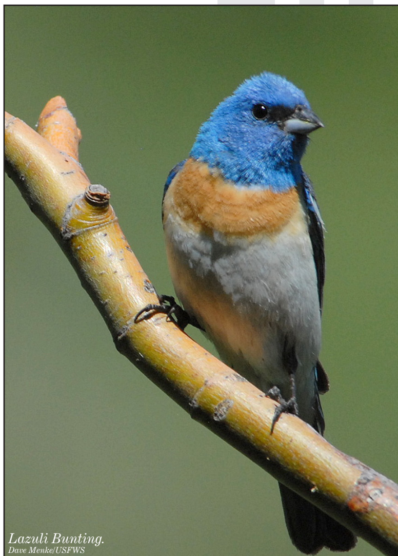
Lazuli Bunting.