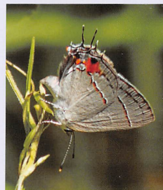
Gray hairstreaks ( Strymon melinus ) have small tails and eyespots that are animated by shifting their wings. Predators are fooled into biting the tail, not the head.