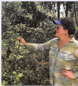
Experts search host plants for signs of butterfly or caterpillar use.

The Refuge's 54,000 acres of native plants, animals and insects are a haven for both migrating and resident butterflies. Large numbers can be seen during peak wildflower season—late summer to early fall. The role of the Refuge is increasingly important as butterfly numbers continue to decline due to habitat loss and climate change. Home butterfly gardens are helpful and provide excellent observation opportunities but they cannot replace the abundant, diverse, year-round host plants and nectar sources found in the Refuge.