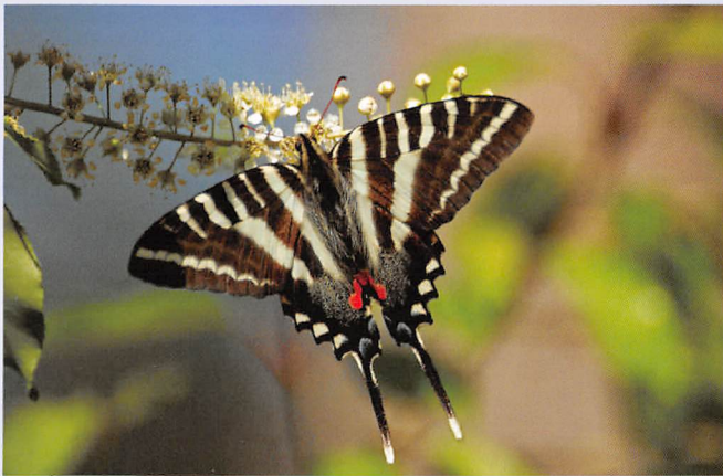
The zebra swallowtail ( Eurytides marcellus ) is Florida's only native kite swallowtail.

The well-managed land in the Lower Suwannee National Wildlife Refuge, with its high habitat diversity, supports large numbers of butterflies year-round. Few other forms of wildlife can be as easily observed. They can even be enjoyed from your car as you slowly drive along the Nature Drive or Dixie Mainline Road. With a little knowledge and a sunny day you could spot at least 15 species, and with experience, you might identify an astounding 54 species.