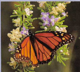
A monarch feeding on Carolina wolfberry ( Lycium carolinianum)

Probably the best known and most recognizable butterfly species in North America, the monarch ( Danaus plexippus ) is in trouble. Researchers continue to learn reasons for its declining numbers. Major threats are from loss of habitat and host plants. Monarchs return to the same rapidly disappearing forests in the southwestern U.S. and Mexico to overwinter each year. Efforts are underway to preserve those sites but climate change threatens to render the habitats unsuitable by the end of the century.