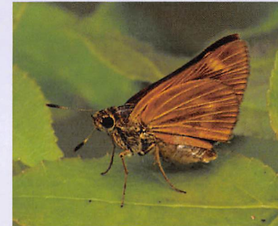
Byssus skippers ( Problema byssus ) can be difficult to identify due to a lot of variability in appearance.