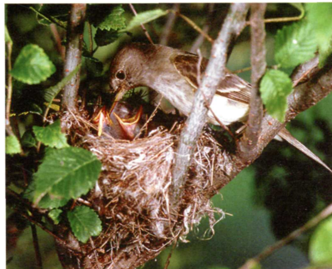
Southwestern willow flycatcher

...that scientists learned about local climate changes by studying core samples from Lower Pahranaagat Lake? The vegetation preserved in these samples, including 2,000-year-old pollen and seeds, revealed that the Pahranaagat Valley once supported conifers such as pinon pine, indicating that wetter and cooler climate cycles occurred.