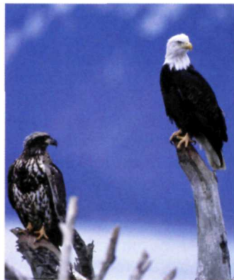
Juvenile and adult Bald eagles (above)

Cottonwood and willow leaves turn brilliant yellow in autumn. Marsh plants begin to change color as well, creating a mosaic of yellows, tans, and reds. In a reversal of spring, large numbers of ducks, shorebirds and songbirds migrate south, stopping to rest and refuel. Lizards, snakes and tortoises become less active due to cooler temperatures. Mule deer begin breeding, and mature bucks with large antlers can be observed.