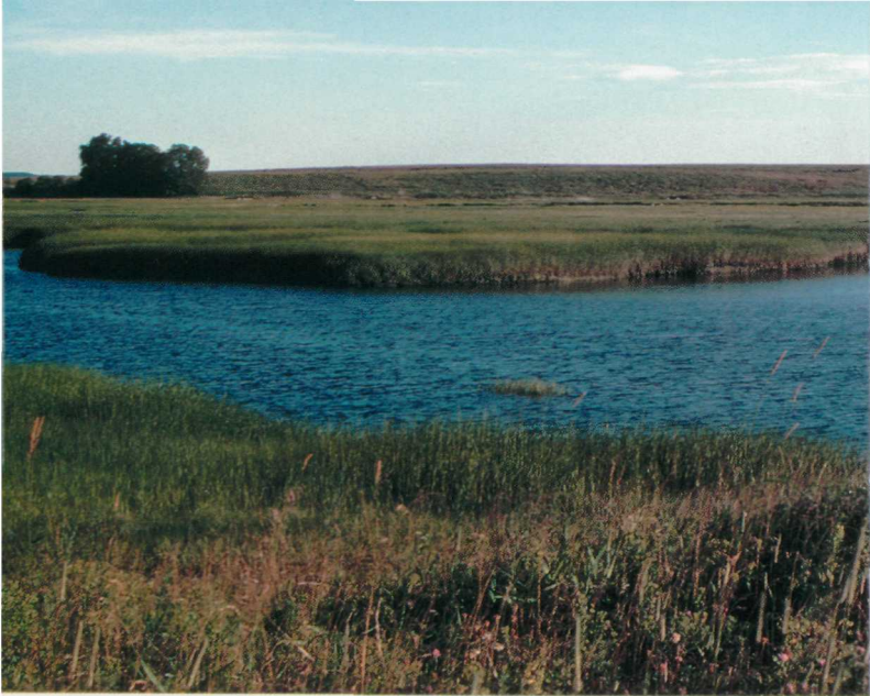
Unspoiled scenery adds to the pleasure of a refuge visit.