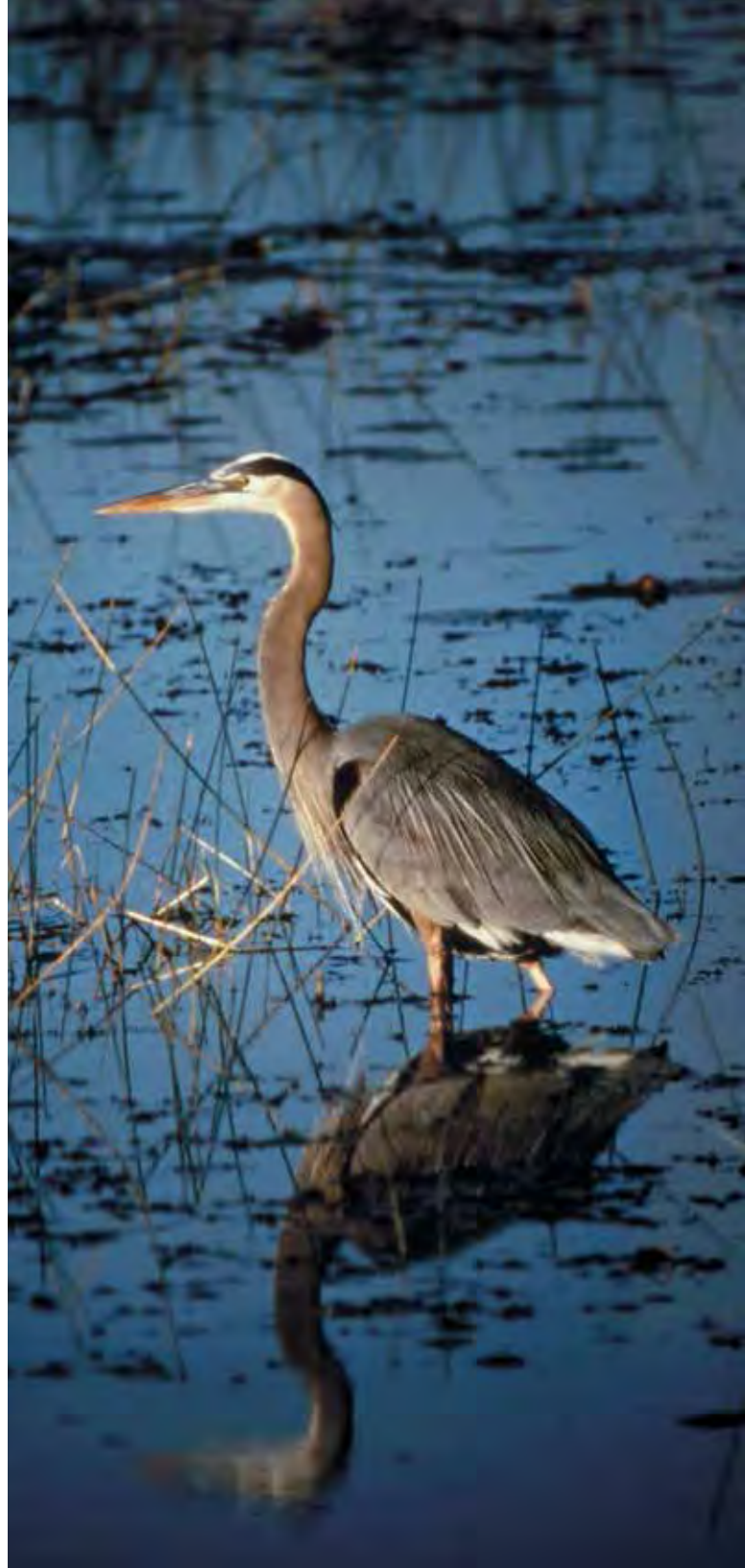
Great blue heron H. Stein