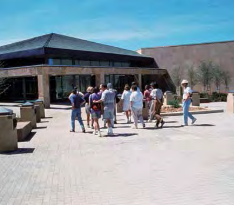
The National Wildlife Visitor Center

5 miles of trails exist for hiking only (no bicycles are allowed). Trails and the seasonal tram tours highlight wildlife habitat and management practices.