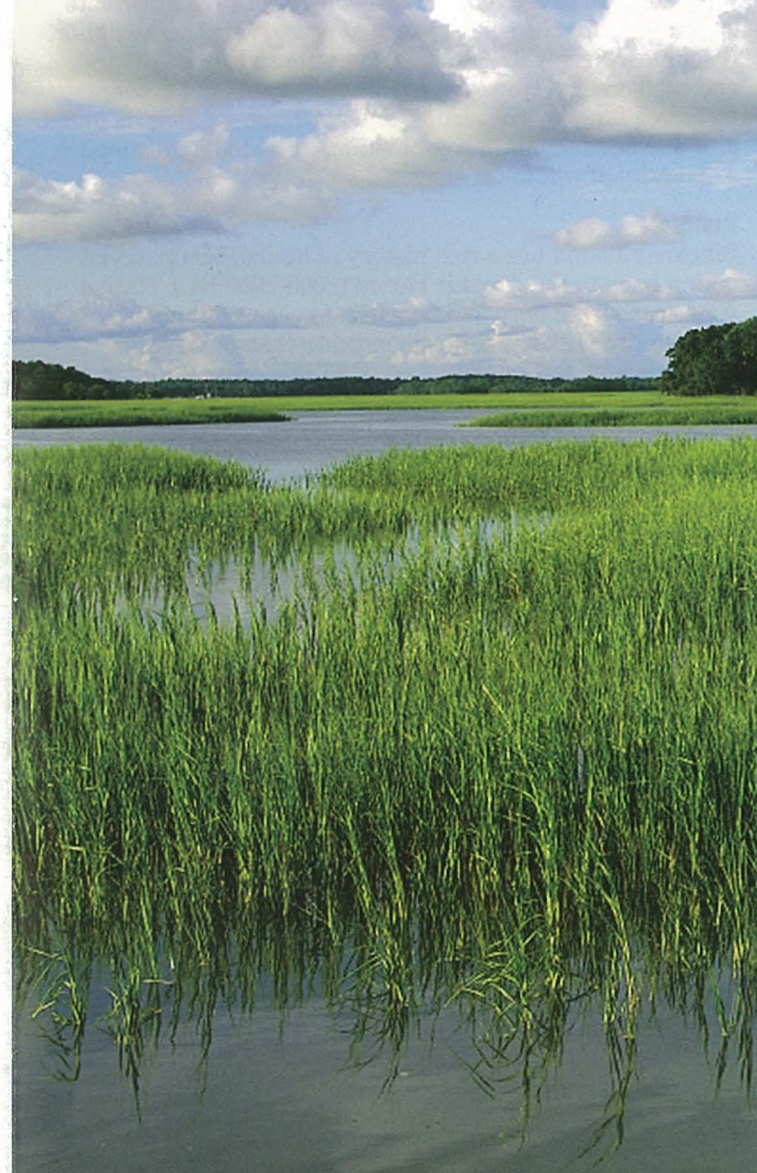
Salt marsh