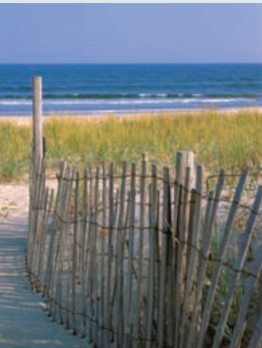
Virginia's Chincoteague National Wildlife Refuge, perched on a fragile, 37-mile-long barrier island, is incorporating sea-level rise projections into its new 15-year management plan.

Work on Chincoteague's SLAMM project began in May 2008. SLAMM was initially developed in the mid-1980s with Environmental Protection Agency funding. The system, which involves the