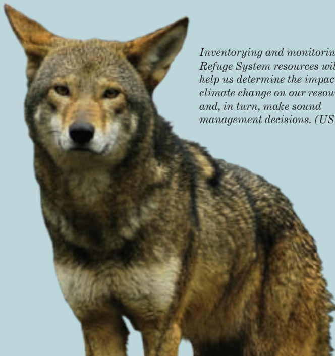
Inventorying and monitoring Refuge System resources will help us determine the impacts of climate change on our resources and, in turn, make sound management decisions.