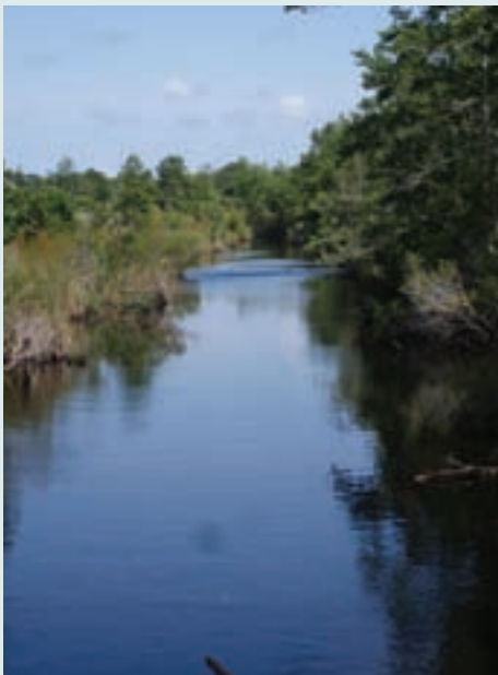
Alligator River Refuge, NC, and The Nature Conservancy are collaborating on a innovative sea-level adaptation project. Lessons learned there could be applied to other coastal areas in the United States and abroad. (USFWS)

The Service is "greening" its infrastructure, increasing the use of alternative energy and seeking to become carbon neutral.