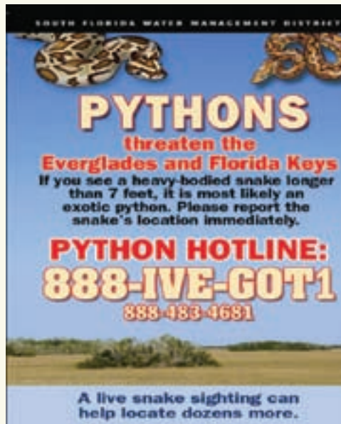
A recent report said the Burmese python's potential for range expansion extended into the entire southern third of the country.

How did a native Asian reptile become a major U.S. menace? According to the Service, animal traders imported some 100,000 of the colorful snakes between 1996 and 2006, captive bred them and sold them as pets. But some owners were not charmed when, after a year, their 20-inch hatchlings morphed into hungry eight-footers. They released them illegally into the wild.