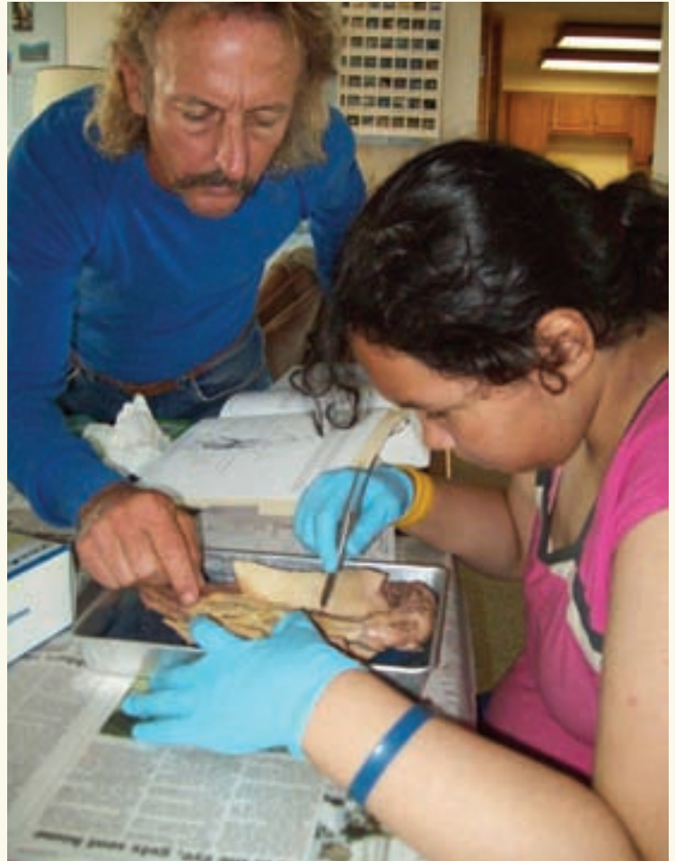
In Alaska, junior rangers are helping to preserve World War II artifacts.