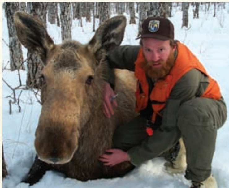
Careful planning – and patience – led to the establishment of a thriving population of moose.

The moose harvest reflected not only the skills of the hunters, but also the long-term support of biologists at Togiak National Wildlife Refuge and a highly effective management strategy designed to establish a population of moose near the villages. The plan was devised by the villages, working in concert with Togiak Refuge and the Alaska Department of Fish and Game.