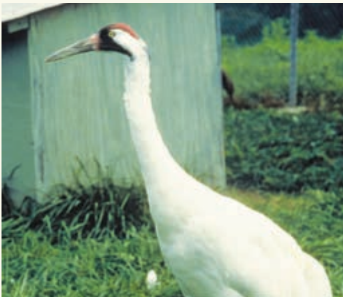
Twenty-three whooping cranes were found dead on or near Aransas National Wildlife Refuge, TX, the second-worst instance of whooper mortality in 20 years.

After three years of extensive habitat restoration and the construction of a