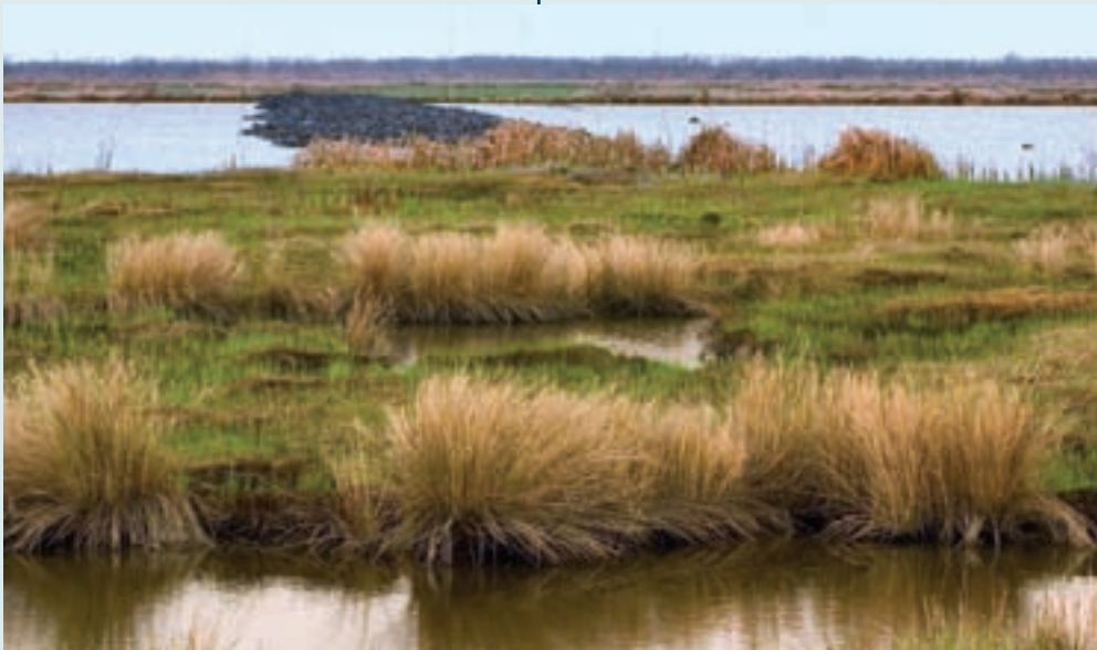
The drivers for land protection have evolved over the decades as the Refuge System has grown to include more land – and water.

“Expansive view of landscape conservation that will require more integration . . . ”