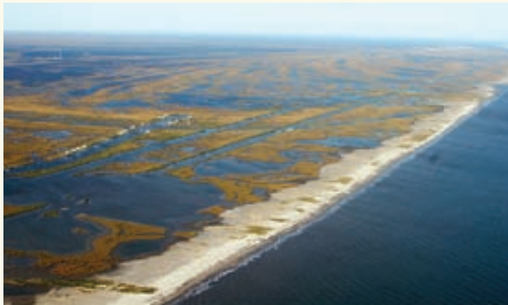
Nearly 60,000 acres of vital wetlands are disappearing every year from coastal watersheds in the eastern United States, according to a new report.

The study targeted coastal watersheds of the Atlantic Ocean, Great Lakes and Gulf of Mexico. A majority of the coastal wetland loss occurred in the Gulf of Mexico. The estimates there were made