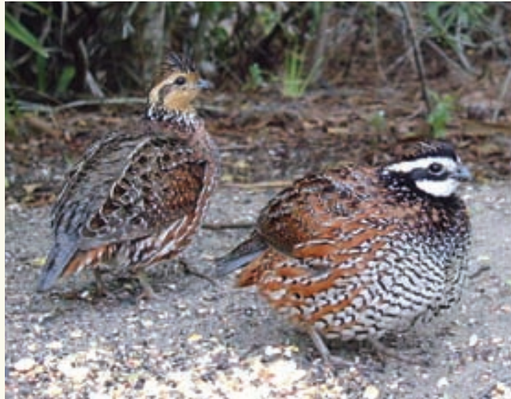
Although some species of birds are rebounding, nearly a third of America's bird species – the northern bobwhite among them – are at risk, according to new report.

However, the new report also includes convincing evidence that birds can respond quickly and positively to conservation action. The data show