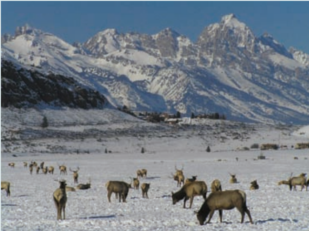
The era of climate and land use change imposes a mandate for a different model of land protection.

protection strategies well beyond fee simple acquisitions and easements and will include incentive programs for our conservation partners on private lands.