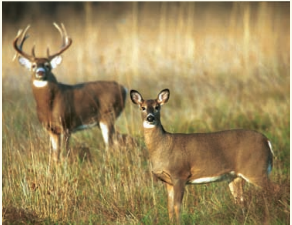
Plenty of habitat for deer, not so much for black bears.