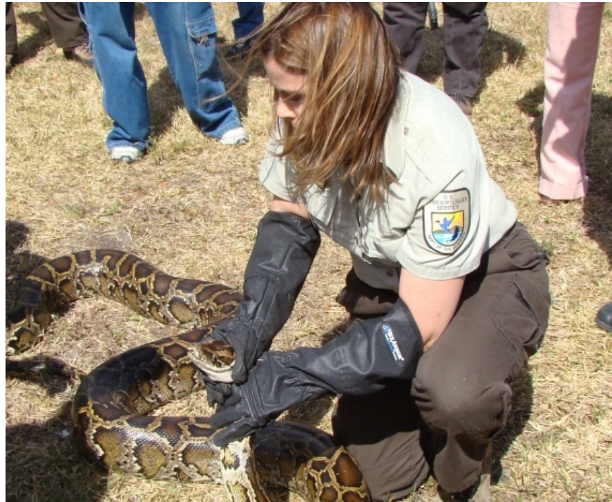
In Florida, an exploding population of pythons is threatening national wildlife refuges in the Florida Keys and north as far as Arthur R. Marshall Loxahatchee Refuge.