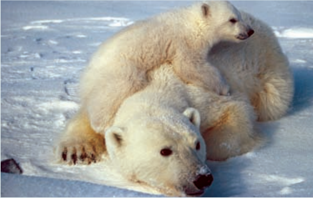
The U.S. Fish and Wildlife Service's climate change strategy, as well as actions now underway throughout the Refuge System, underscore the urgency attached to dealing with the most compelling conservation challenge of this century.

supporting efforts to buffer the eroding effects of wind and tides (see page 8). Across the country, cutting-edge science and technology are being used to gauge the effects of changing precipitation patterns on waterfowl production habitat and guide land-protection actions.