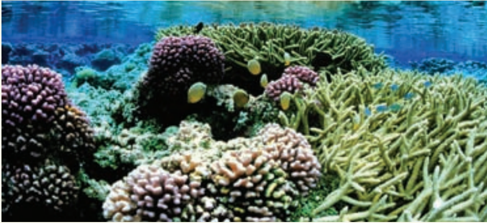
Palmyra Atoll National Wildlife Refuge has been designated a Ramsar Wetland of International Importance – the first in the United States to include coral reefs.

P almyra Atoll National Wildlife Refuge has been designated a Ramsar Wetland of International Importance – the first in the United States to include coral reefs. Among other benefits, the Ramsar designation typically leads to increased attention to a site, which can lead to increased interest by the scientific community.