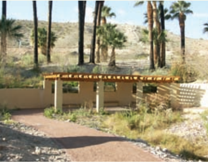
Moapa Valley National Wildlife Refuge, NV, recently reopened to the public. New attractions include a viewing chamber that features a stream cross section, showcasing the endangered Moapa dace.

short walking trail, a kiosk and a group shelter; Moapa Valley National Wildlife Refuge is now open to public. Visitors can walk through a new viewing chamber that features a stream cross section, showcasing the endangered Moapa dace, a fish found only in the warm springs of southern Nevada.