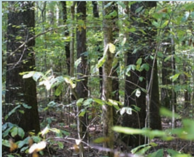
The seeds for the U.S. Fish and Wildlife Service's terrestrial carbon sequestration initiative were first planted in the Lower Mississippi Valley.

Typically, energy companies purchase and restore land based on the Service's