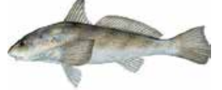
Southern Kingfish (Whiting)