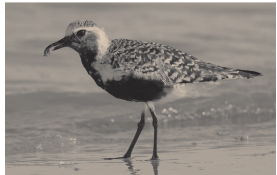
Black Bellied Plover