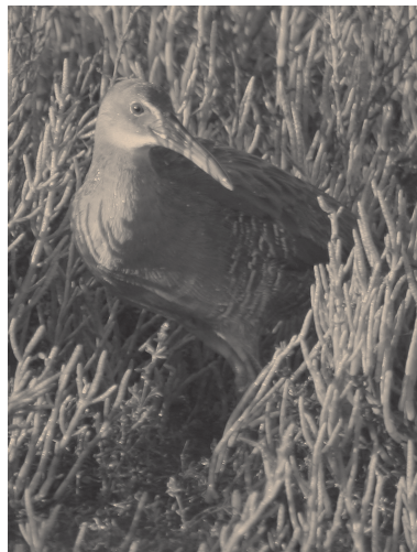
Light-footed Clapper Rail