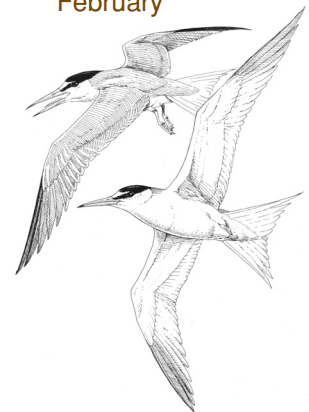
California Least Terns