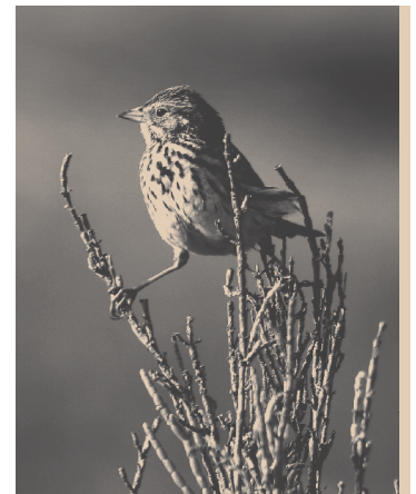
Belding's Savannah Sparrow