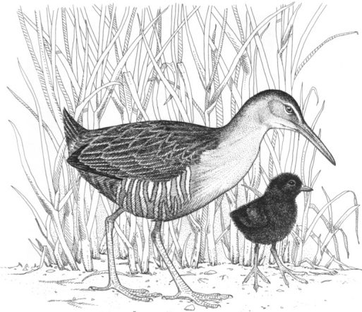
Light-footed Clapper Rail

The refuge is designated a "Globally Important Bird Area" by the American Bird Conservancy and during winter months has one of the highest concentrations of raptors anywhere in the U.S.. More than 200 species of birds can be found within the refuge and on adjoining Navy lands including the endangered light-footed clapper rail, CA least tern, CA brown pelican, and Belding's Savannah Sparrow.