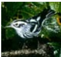
Black & White Warbler

To report unusual sightings, or for further information, contact: