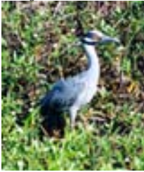
Yellow-crowned night Heron