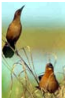
Female Boat-tailed Grackles