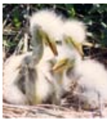
Young Great Egret