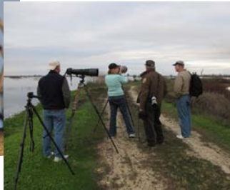
Refuge birding tour using trails

●●●● The trails marked in red will take you under the riparian forest canopy, where you can enjoy the variety of songbirds. Birds, such as the Western kingbird and spotted towhee, depend on the forest habitat for migration corridors and nesting areas.