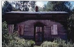
The McClintock-Steele-Waitz House, 1999. Preservation PA, Inc. added the home to its list of Pennsylvania's Most Endangered Historic Properties in 1997.