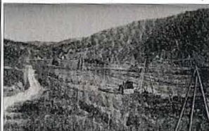
Steele Farm along Oil Creek, c. 1864