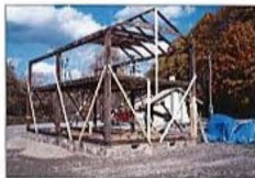
In 2001, workers reconstructed Coal Oil Johnny's home at Rynd Farm inside Oil Creek State Park.

behind the walls, attic and sub-floor ventilation, stronger boards