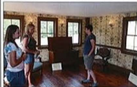
Visitors explore the rehabilitated parlor, 2011.

The Oil Region Alliance undertook the home's interior restoration in 2005. Following the design of architect David Strickland, Gustafson General Contracting added insulation, electricity, and stove behind the building. The crew also finished the home's original floors and staircase. New interior decorations, including period-accurate wall coverings and light fixtures resembling those of the 1860s-1870s,