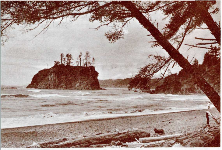
Pacific Ocean coastline