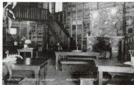
The former Round Spring lodge as it looked in the 1960s.

The establishment of the Ozark National Scenic Riverways came in 1964. Round Spring, along with Alley Spring and Big Spring state parks, were placed under National Park Service management in 1969. With the addition of the three state parks, Ozark National Scenic Riverways was complete.