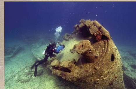
Diver documents bow of U.S.S. Macaw at Midway Atoll

boats played a critical role in Hawai'i and the Pacific. From within HURL's Pisces IV and V , research submersibles at a depth of about 1,400 feet, researchers recorded images of the crash sites, using digital video and still cameras. Preservation legislation supports the survey and inventory of these types of sites, and Navy ships and aircraft are specifically protected as military vessels.