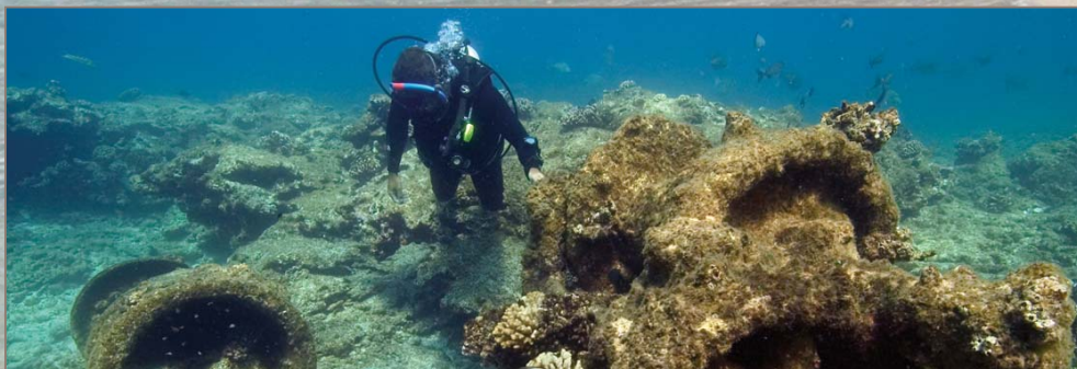
Underwater archaeologist and artifacts at the Carrollton shipwreck site, a sailing bark lost in 1906

With a history of approximately 1,500 years of continuous and intensive maritime activity, the Hawaiian Archipelago contains many historic shipwrecks and other types of submerged archaeological sites. The locations in this region witnessed a variety of Hawaiian and Pacific vessels and activities. These include traditional voyaging and fishing, aquaculture, copra traders, Japanese sampans, transpacific colliers, and the local wreckers or salvage companies from the main Hawaiian Islands, in addition to the naval activity that is a large part of Pacific Islands history. Documents indicate that there are over 80 U.S. Navy ships and submarines, hundreds of commercial sailing and steam vessels, and over 1,500 navy aircraft lost in these waters. Many of these vessel and aircraft losses are U.S. naval property and war graves associated with major historic events, or are sites older than 100 years and of potentially historic and archaeological interest.