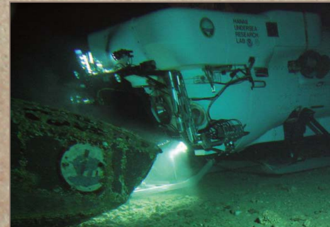
HURL submersible at the bow of a 1930's PK-1 flying boat