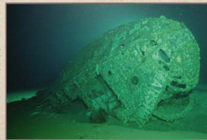
Bow of the JRM-1 Martin Mars flying boat south of Pearl Harbor

In December 2004, NOAA was involved in an interagency project to survey the seafloor for submerged aviation wrecksites. Seaplanes and flying