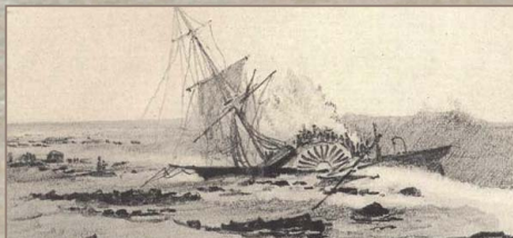
Survivor's drawing of U.S.S. Saginaw wrecked on the reef at Kure Atoll

The U.S.S. Saginaw captures a critical period of American involvement in the Pacific. Commissioned in 1860, she was a historic vessel of the "old steam navy." On October 29, 1870, the U.S.S. Saginaw was checking Kure Atoll for castaways on her way home from Midway to San Francisco when, due to unexpected currents, she ran aground on the reef. The ship's crew established a camp ashore until they were rescued two months later after five volunteers had sailed the captain's 22-foot gig to find help in the main Hawaiian Islands. The gig was caught in heavy surf at Kaua'i, leaving a sole survivor, William Halford. The remaining sailors were rescued by the S.S. Kilauea 68 days after the shipwreck.