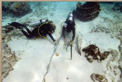
Underwater archaeologists investigating ship timbers beneath the sand

In the first half of the 19th century, whaling operations spread north into the Pacific basin in search of lucrative whaling grounds off South America, Australia, Japan and, finally, the Gulf of Alaska and the Bering Sea. Soon after the Balaena and the Equator harpooned the first whale off the coast of Maui in 1819, Hawai'i won its place on whalers' charts. Several whaling shipwrecks have recently been discovered in the Northwestern Hawaiian Islands and are currently being documented. Whaling wreck sites at Kure and Pearl and Hermes Atoll add to our understanding of 19th century voyaging in the Pacific.