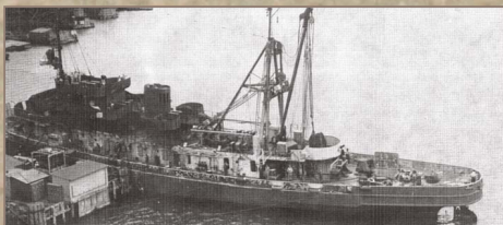
U.S.S. Macaw port side photo, Moore Drydock Company Photo Credit: Courtesy of National Archives

The U.S.S. Saginaw captures a critical period of American involvement in the Pacific. Commissioned in 1860, she was a historic vessel of the "old steam navy." On October 29, 1870, the U.S.S. Saginaw was checking Kure Atoll for castaways on her way home from Midway to San Francisco when, due to unexpected currents, she ran aground on the reef. The ship's crew established a camp ashore until they were rescued two months later after five volunteers had sailed the captain's 22-foot gig to find help in the main Hawaiian Islands. The gig was caught in heavy surf at Kaua'i, leaving a sole survivor, William Halford. The remaining sailors were rescued by the S.S. Kilauea 68 days after the shipwreck.