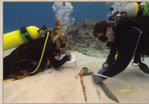
Underwater archaeologists map a 19th century whaling shipwreck site

The Pacific Islands include the most geographically isolated locations in the world. Nonetheless, these islands host a diverse marine environment. These aquatic settings range from rich coastal ecosystems of wetlands, shorelines and coral reefs, to the unexplored depths of the deep ocean trenches. As rich as the marine environment is in animal and plant species, the Pacific Islands retain a culture