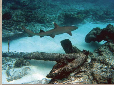
Whaling shipwreck site at Pearl and Hermes Atoll

unique to themselves. Our island world revolves around the ocean—for pleasure, transportation and physical and spiritual sustenance, the ocean has shaped the way Pacific societies have evolved.