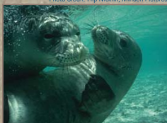
Hawaiian monk seals