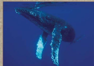
Humpback whale calf Photo Credit: Flip Nicklin, Minden Pictures, NOAA Fisheries #987

Our national marine sanctuaries embrace part of our collective riches as a nation. Within their protected waters, giant humpback whales breed and calve their young, coral colonies flourish, and shipwrecks tell stories of our maritime history. Sanctuary habitats include beautiful rocky reefs, lush kelp forests, whale migration