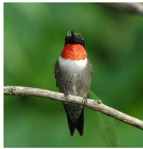
Ruby-Throated Hummingbird