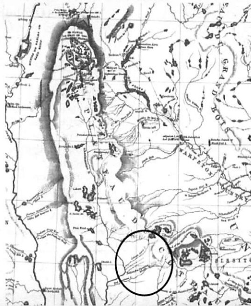
1839 manuscript map of the area, by Joseph N. Nicollet. Pipestone is located near the bottom center of the map, noted by him as 'Indian Red Pipestone Quarry' (circled)

Where ice flowed directly over bedrock, embedded hard stones left grooves called glacial striae . Outcrops were also sand-blasted by strong winds from the north, which picked up silt and fine sand from glacial plains. This produced the natural polish seen on the bedrock outcrops near the Monument's Winnewissa Falls.