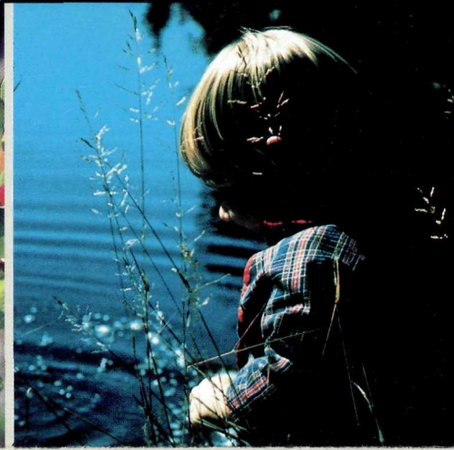
he wonder of ripples preoccupies a child.