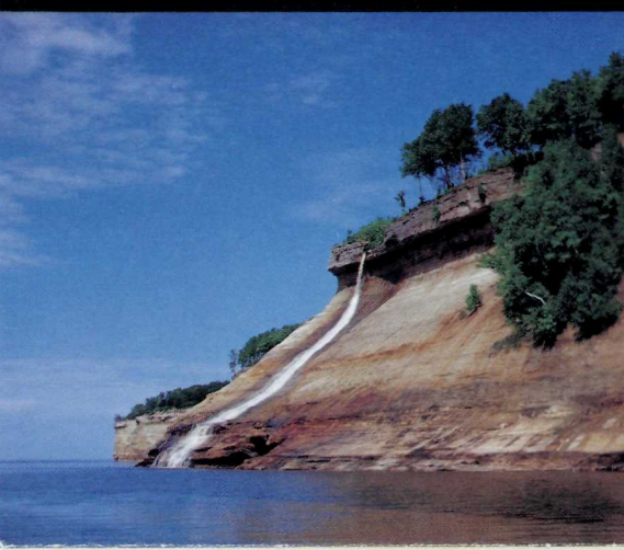
Bridal Veil Falls flows down to the lake.