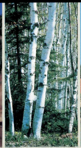
A white birch forest greets the visitor.