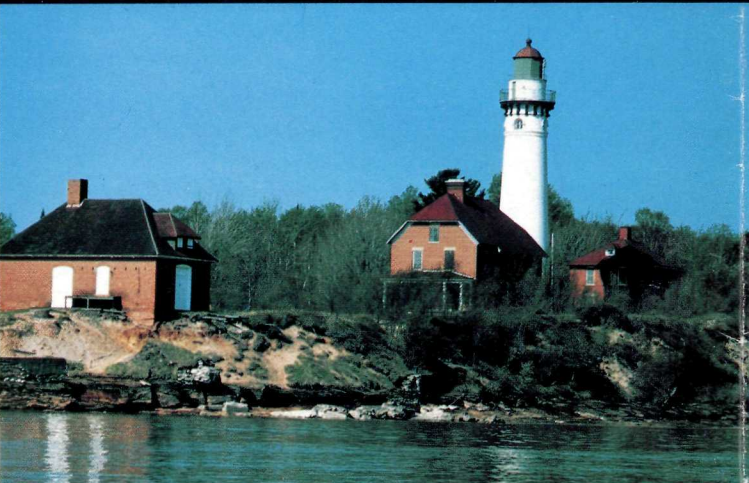
Au Sable Light Station protects the lake-borne traveler