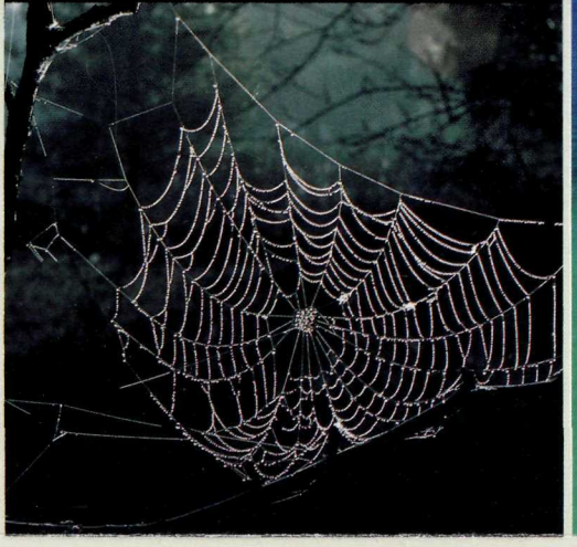
Heavy dew on a spider web presages a beautiful day.