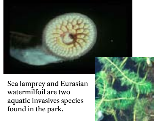
Sea lamprey and Eurasian watermilfoil are two aquatic invasives species found in the park.

Pictured Rocks National Lakeshore contains many pristine lakes and streams that are threatened by unwelcome visitors—invasive aquatic plants and animals. These non-native organisms can negatively impact wildlife habitat, upset the food chain, and out-compete native species. Both Lake Superior and several of the park's inland lakes have already been affected.