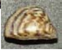
Zebra Mussel ( Dreissena polymorpha )

Asiatic clams and zebra and quagga mussels are fast, prolific breeders that fortunately have not yet been found here at the park. Asiatic clams can choke out native species by growing on their shells. Zebra and quagga mussels consume vast amounts of nutrients and alter water clarity. An infestation of these mollusks would have a devastating impact on park aquatic environments.