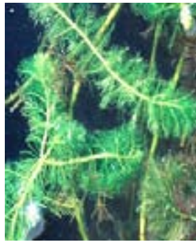
Eurasian Watermilfoil ( Myriophyllum spicatum )

Eurasian watermilfoil forms dense mats that choke out native plants and restrict habitat for aquatic wildlife. Small bits of plant (often caught in boat propellers or stuck to trailers) can get transported to new areas. This plant is already growing at Sand Point. Please take care not to introduce it to inland lakes!