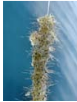
Spiny Water Flea ( Bythotrephes longimanus )

Asiatic clams and zebra and quagga mussels are fast, prolific breeders that fortunately have not yet been found here at the park. Asiatic clams can choke out native species by growing on their shells. Zebra and quagga mussels consume vast amounts of nutrients and alter water clarity. An infestation of these mollusks would have a devastating impact on park aquatic environments.