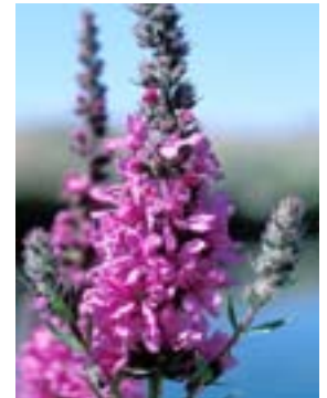
Purple Loosestrife ( Lythrum salicaria )

Purple loosestrife is an aggressive wetland invader that displaces native plants. It grows well from both rhizome and seed, and will quickly reduce an open wetland to a dense mat of blooms. A mature plant can produce up to two million seeds a year! A small patch of purple loosestrife was removed from the park ten years ago and has not returned. Help us keep this unwanted visitor OUT!