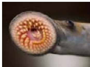
Sea Lamprey ( Petromyzon marinus )

The sea lamprey is a parasitic ocean fish that feeds only on the blood and fluids of large game fish such as lake trout. Sea lampreys migrated from the Atlantic Ocean into the upper Great Lakes after completion of the Welland Ship Canal in 1932. Current management includes chemically treating park streams where sea lampreys spawn and using traps to catch adults.