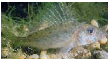
Eurasian Ruffe ( Gymnocephalus cernua )

This bait-stealing menace arrived as a stowaway aboard European trade ships. Females lay many eggs, which the males guard. These bottom dwellers easily outcompete native species, take over spawning habitat, and alter the food web.