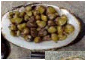
Asiatic Clams ( Corbicula fluminea )