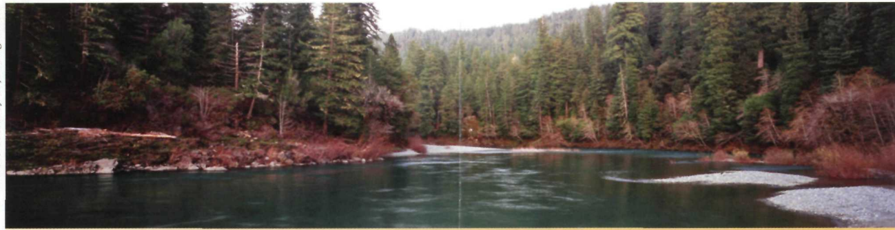
The scenic Smith River

the Pacific coast. In 1821, at age 22, he came west and joined the fur-trapping party of General William Ashley. By late 1826, Smith and two partners had bought out General Ashley. Smith led his trappers across southern Utah, Nevada, Arizona, the Mojave Desert and Cajon Pass to Mission San Gabriel, where they rested for two months.