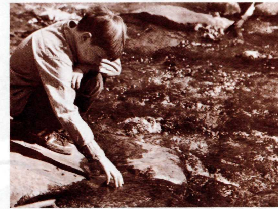
Shenandoah has three National Environmental Study Areas (NESA) for school class use.

At peace with the ages, the wilderness heights of the Blue Ridge lie in quiet repose above the pastoral beauty of the Shenandoah Valley.