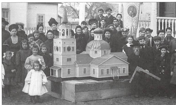
School children and clergy with a model of Saint Michael's Cathedral outside the Russian Bishop's House ca. 1900.

Although the fur trade eventually dwindled and the Russian American Company managers returned to Russia, the Russian Orthodox Church continues to thrive in Alaska today. The Russian Bishop's House is a tangible reminder of the role that the Russian Orthodox Church played in Russian America and the history of Alaska.