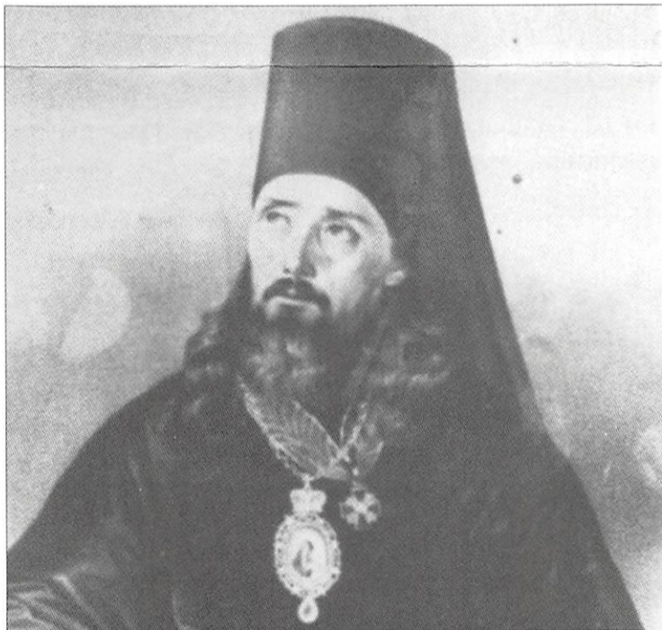
Bishop Innocent in 1840

In 1841, Bishop Innocent arrived in Sitka to assume leadership of a vast new diocese that included both Alaska and Kamchatka. As the center of authority for the Orthodox Church in Russian America, he had the power to shape the church's presence. He also had a strong interest in Native cultures. Under his direction, these came together in an approach to missionary work that incorporated Native language and clergy.