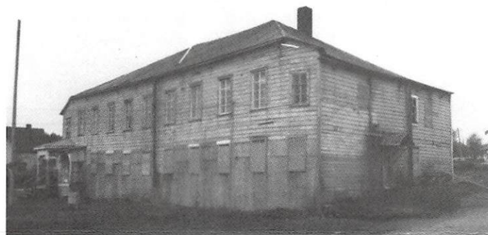
The Russian Bishop's House before restoration

The house continued in the hands of the Orthodox Church after the 1867 sale of Alaska and many original furnishings remain. By the 1960s, maintenance needs finally overwhelmed the church's ability to keep the 125 year-old structure intact. In 1972, the U.S. Congress authorized the purchase and restoration of the house by the National Park Service, setting the stage for a more than fifteen-year project to restore the house to its 1853 appearance.