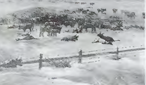
Harper's Weekly graphically depicted the plight of cattle caught on the