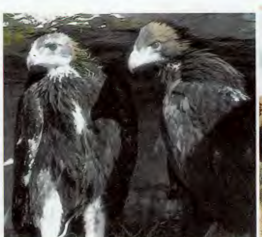
mature ones here-nest in the badlands, feeding

tones." Both mule deer and whitetail deer inhabit the park. The whitetails prefer the river woodlands and the mule deer like the more broken country and the uplands. Prairie dogs, historically a staple food source for many predators, live in "towns" in the grasslands. Through careful management some animals that nearly became extinct are once again living here. Buffalo, for example, were reintroduced in 1956. Keep your eyes open; there's a lot to see.