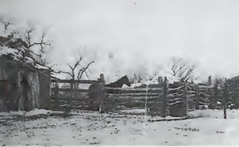
This was the farmyardcorral and outbuildings-of the Maltese Cross