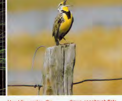
Heralding spring, the meadowlark's song drifts across the prairie. The