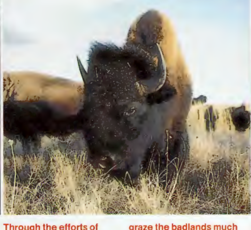
graze the badlands much as they once did, though they are now confined to