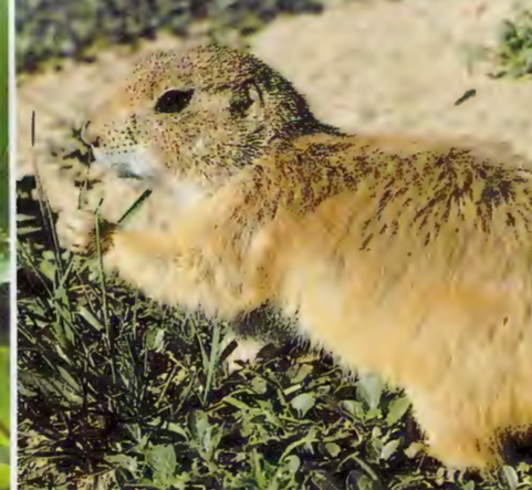
Prairie dogs have an elaborate social structure. This sense of community