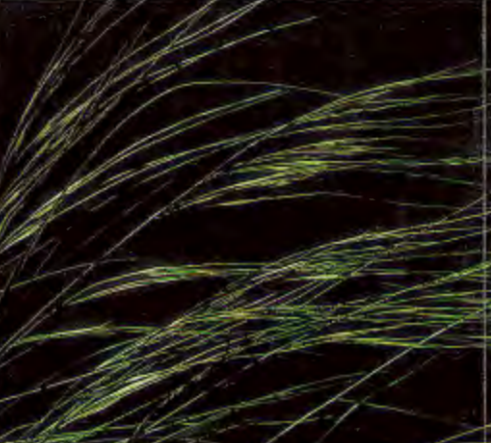
park. It provides critical thread is an important component of the mixed