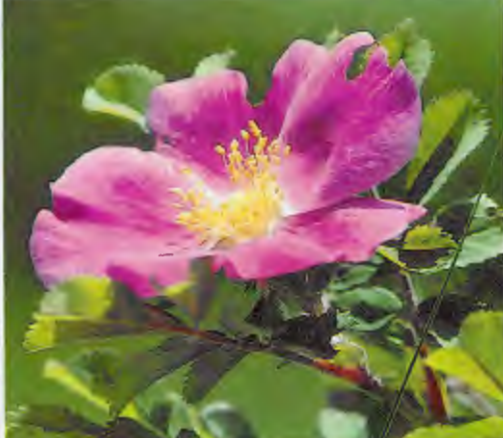
brighten the badlands from early spring until great number of wildlowers that delighted