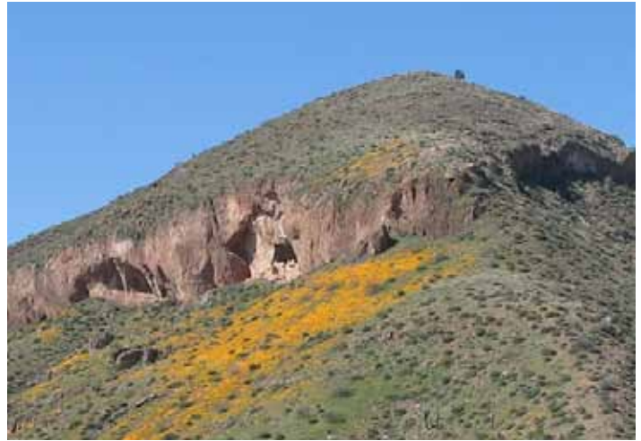
The cliff dwellings at Tonto National Monument were built within natural alcoves in Dripping Spring Quartzite, stone that formed perhaps as much as 1 billion years ago.

Paleozoic seas (185 to 520 million years ago), resulted in accumulations of sedimentary rock and vast thicknesses of limestone. Most of the rocks deposited during this period later eroded, again leaving a sketchy record of geological events until approximately 10 to 30 million years ago, when tremendous forces wrenched apart the rocks, raising up huge blocks, and dropping others down in a jumbled mass of mountainous terrain through which molten rock was interjected and overlain.