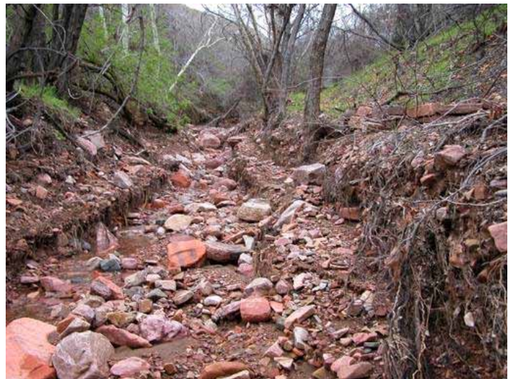
Eroded Gila Conglomerate in a wash in Tonto National Monument.

1940 Ep-Archean and Ep-Algonkian Erosion Surfaces, Grand Canyon, Arizona. Geological Society of America Bulletin 51:1253-1270.