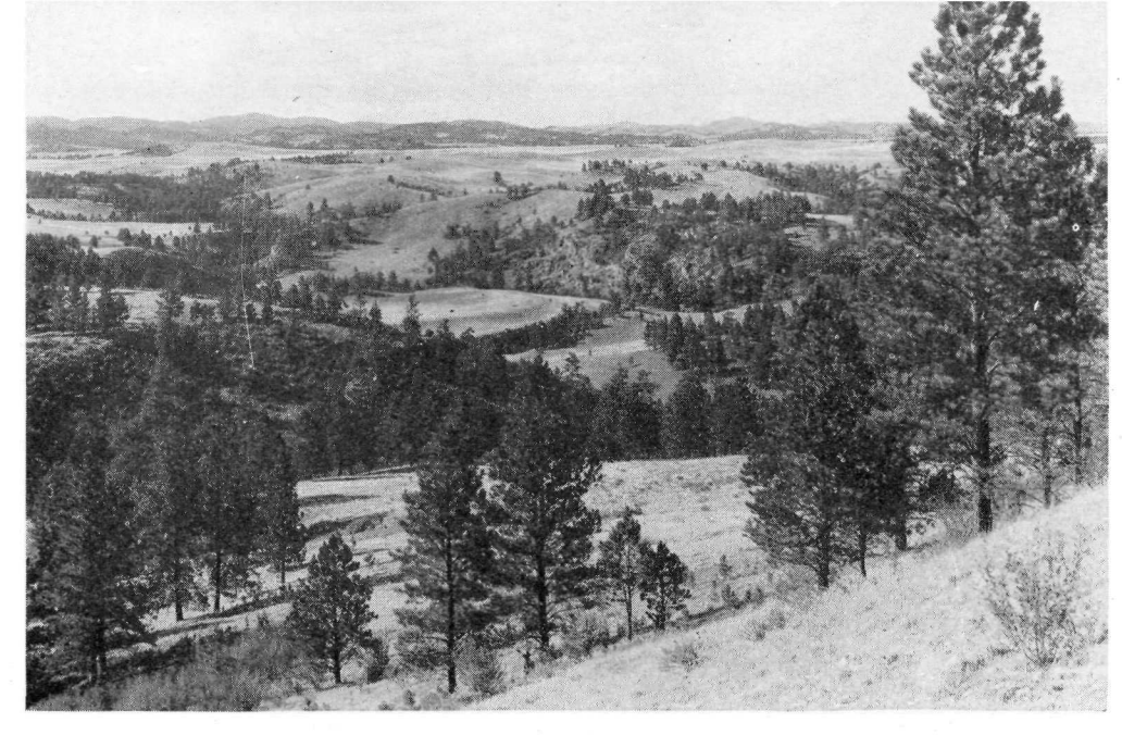
Wooded and plains country, typical of the southern Black Hills

The Sioux Indians, a tribe conspicuous even among Indians for strength and bravery, long occupied the region and only submitted to white settlement after a bitter and tragic struggle. Some of their descendants are today living on the Pine Ridge and Rosebud Indian Reservations, a short drive from Wind Cave.