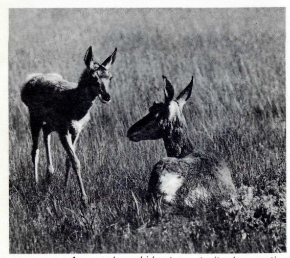
A pronghorn kid returns to its doe, resting in the spring grass of the South Dakota plains.