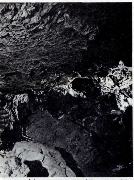
A tour pauses in one of the rooms while a park naturalist explains the boxwork formation.

Sandwiches and light lunches are provided by a concessioner in the visitor center during the summer. Camping supplies are not available in the park. There are numerous private and public campgrounds in the southern Black Hills. Motels, hotels, trailer courts, camping supplies, and garages are in the towns of Hot Springs and Custer.