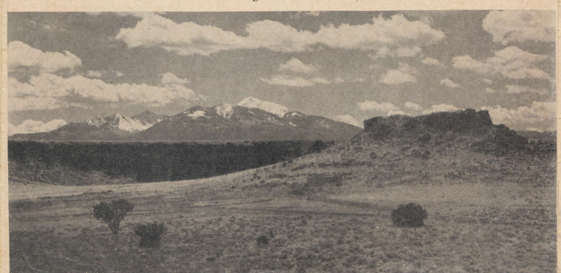
The Citadel overlooking Nalakihu and the limestone sink

Around the Citadel was another concentration of prehistoric Indians. Within I square mile there are more than 100 sites, varying in size from earthlodges to the larger pueblos. The Citadel itself, as yet unexcavated, is a fortified apartment house. Probably it was I or 2 stories high and contained nearly 50 rooms. Its impregnable position on top of a small lavacapped mesa, overlooking a wide expanse of country, suggests that it served as a retreat during times of stress. Numerous loopholes through the thick walls strengthen this impression. On the ter-