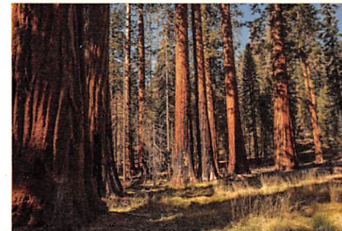
Center Top