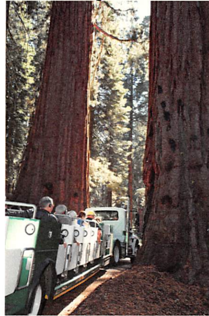
Top Left