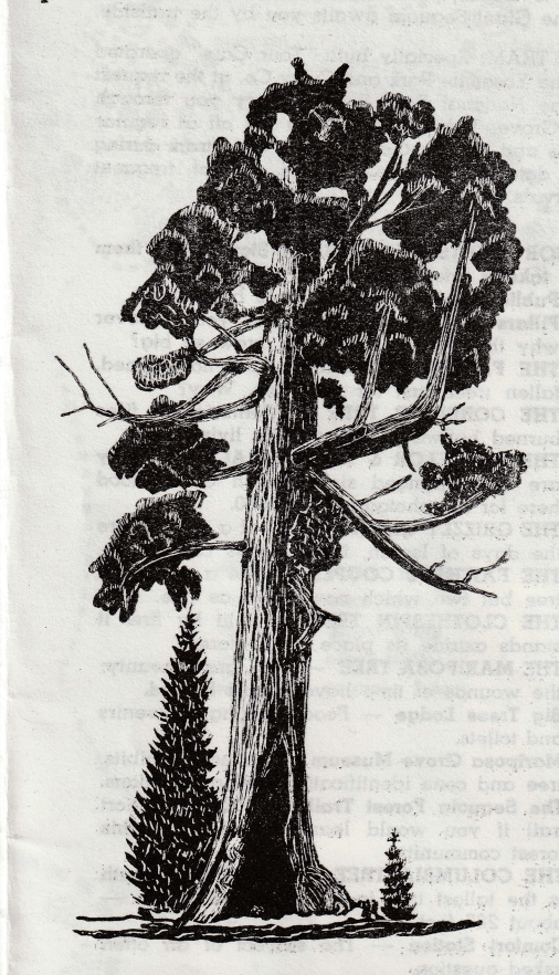
The Grizzly Giant has had a hard life. It was once taller. Though stooped with age its growth is vigorous. 2700 years old, 209 feet tall, 35 feet through—only four sequoias are larger probably none are older.

The tallest sequoias are not the oldest. "Of all living things, only the Giant Sequoia is assured of living long enough to be struck by lightning," said John Muir. The Grizzly Giant is probably the oldest living Sequoia, but it is now only 209 feet tall.