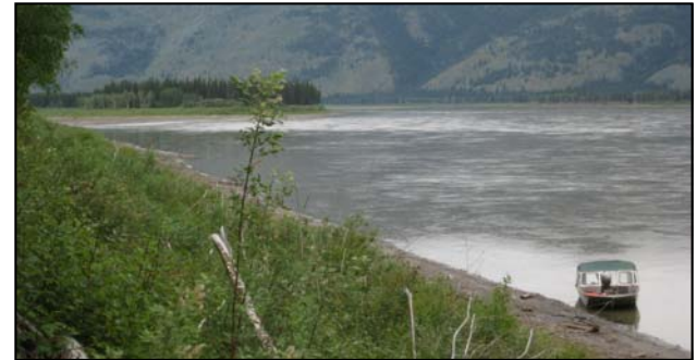
View of Yukon River at Biederman Camp, 2010.