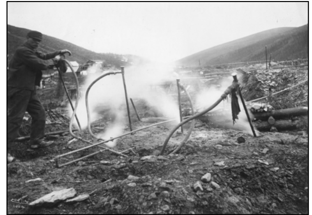
Steam points in use in the Klondike, 1898.