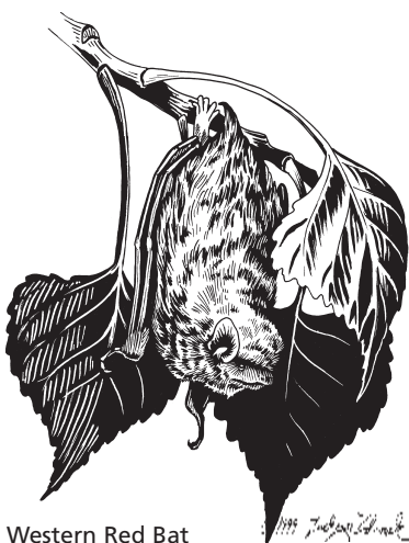
Western Red Bat