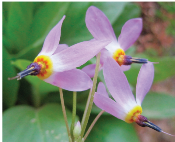
Zion shooting star ( Dodecotheon pulchellum var. zionense )