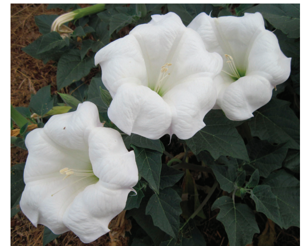
Sacred datura ( Datura wrightii )