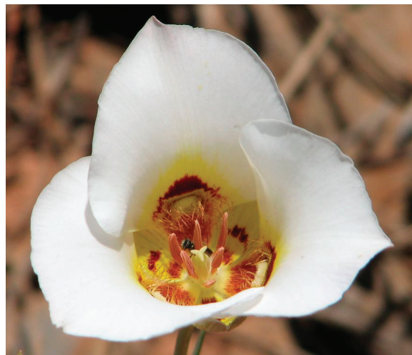
Sego lily ( Calochortus nuttallii )

Goosefoot Family (Chenopodiaceae) Russian thistle* - Salsola kali CD/Su