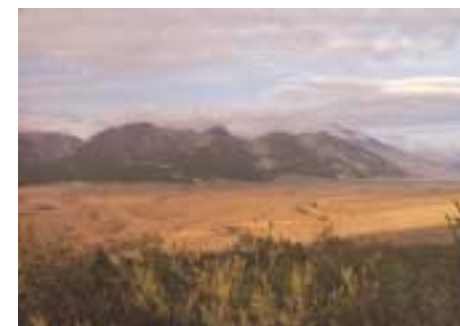
Figure 2. The Valley of Ten Thousand Smokes at sunset, mountains in back are, left to right, Jule Peak and Griggs (formerly known as Knife Peak).