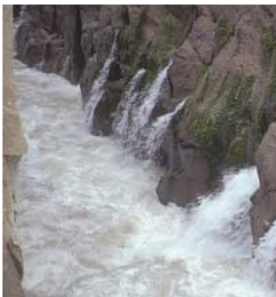
summer 1999