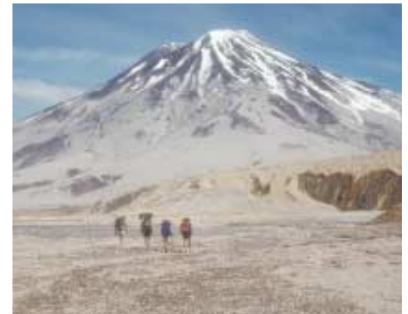
Figure 8. Some volcanoes of the Katmai Cluster.