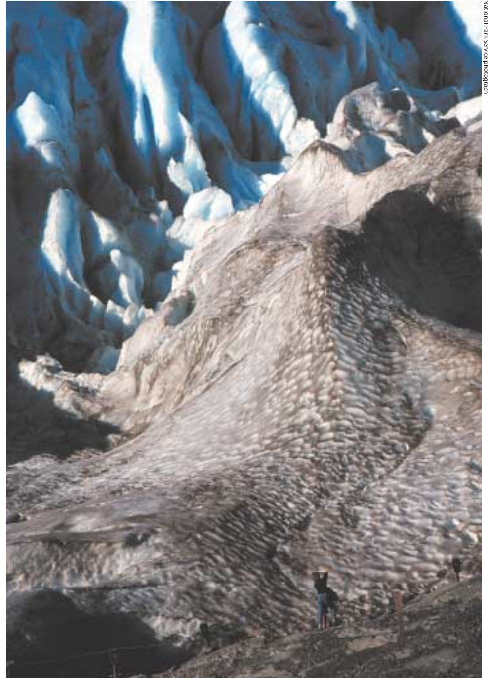
Far Right: Exit Glacier is one of 38 glaciers that flow out from the Harding Icefield.