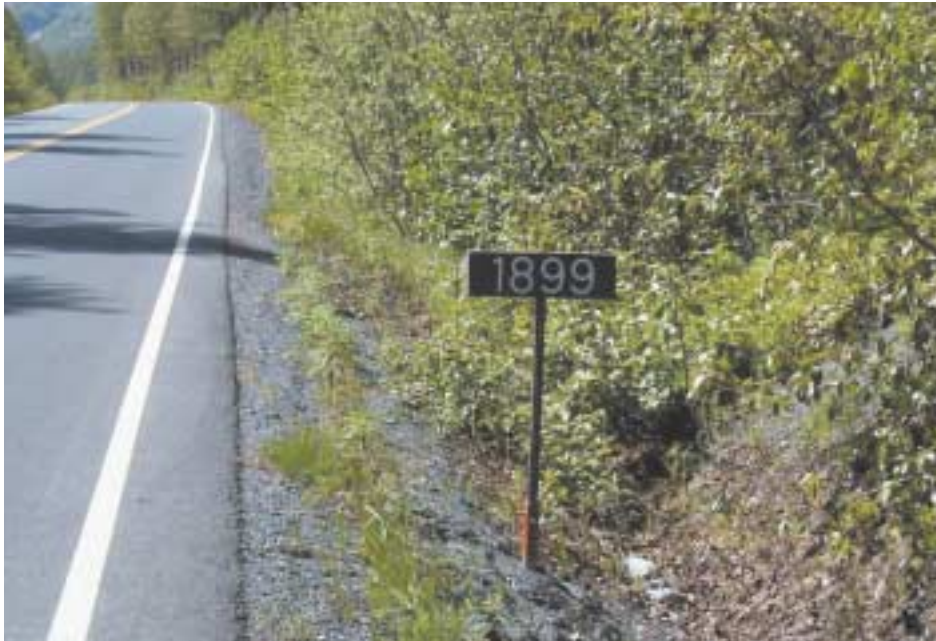
Roadside sign showing the extent of Exit Glacier in 1899.

glacier. As the ice melts, rock deposits are left on the ground in front of the leading edge of the glacier, glacial till. In this way a continuous layer of till is left across the newly exposed valley floor. There are also periods when the ice at the front melts at essentially the same rate as the ice flows down. This is called a period of stagnation, and the front edge of the glacier stays in one place, neither receding nor advancing. The rock and debris, however, continue to be pushed downward to the leading edge of the glacier where it is deposited as the ice melts away. If a period of stagnation lasts for several years, the till will build up higher and higher at the stationary leading edge, creating a long mound of rock at the front of the glacier. When the glacier begins to