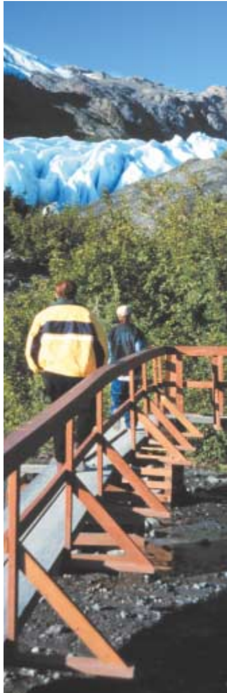
Right: The hike from the parking lot to Exit Glacier is approximately a half mile long.

A very common biological technique, known as dendrochronology, assigns dates to environmental events in the past by counting tree rings. As a tree grows, its